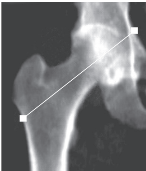
Fig. 2. HAL - hip axis length.