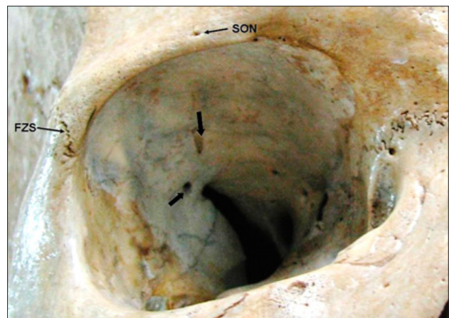
Fig. 2. Anterior view of the right orbit with two meningo-orbital foramen (Block arrows). SON – Supraorbital notch, FZS – Fronto-zygomatic suture.

Department of Anatomy, Kasturba Medical College, Center for Basic Sciences, Bejai, Mangalore, Karnataka state, India