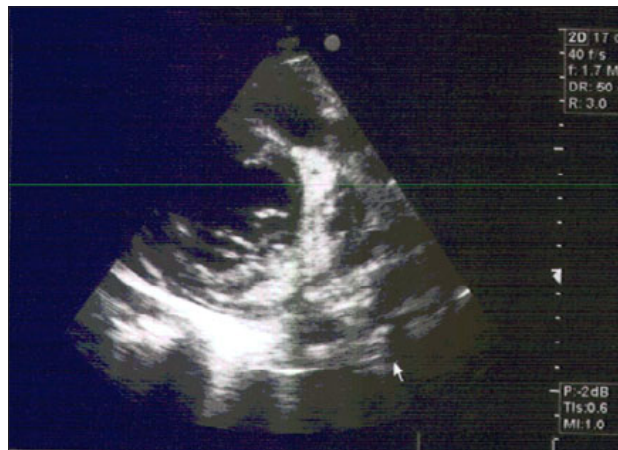
Fig. 4. Echocardiography showing infiltrative cardiomyopathy.

plete regression of myocardial infiltrate. On day +707 after SCT the patient developed relapse in kidneys and BM and she died after a short period. Post-relapse survival 53 weeks.