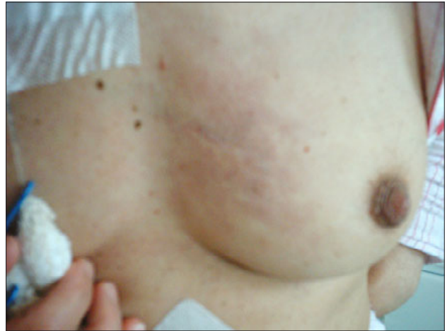
Fig. 1b. Isolated extramedullary relapse of AML in the skin of anterior chest wall after treatment.