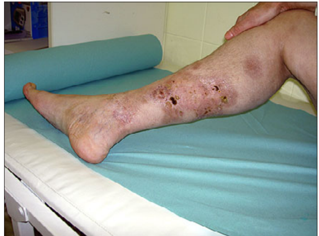
Fig. 2b. Isolated extramedullary relapse of ALL in the skin of lower limbs after treatment.

(TBI), Cyclophosphamide (Cy), antithymocyte globulin (ATG), with post transplantation GvHD prophylaxis. On day +245 of BMT she developed chronic GvHD of the skin, mucous membrane and the liver; treated with corticosteroid and mycophenolate mofetyl. On day +615 of BMT, she developed IEMR in skin of lower limbs (Fig. 2a) (started as bilateral infiltrative lesion, dark red in colour, dry, firm, fixed on the underlying tissues, with skin defect, progressive bilateral leg edema mainly on the left side). Skin biopsy confirmed the lymphoblast infiltration. CBP and BM aspiration, with full haematological and morphological remission, complete donor chimerism. Due to cardiac insufficiency and complex cardiac arrhythmias, treated with corticosteroid and imatinib 800mg/day, with initial response (Fig. 2b). Due to progression of extramedullary relapse with molecular relapse, reinduction CHT was given; but she died shortly after the induction due to sepsis and multiorgan failure. Post-relapse survival 23 weeks.