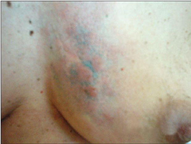
Fig. 1a. Isolated extramedullary relapse of AML in the skin of anterior chest wall before treatment.