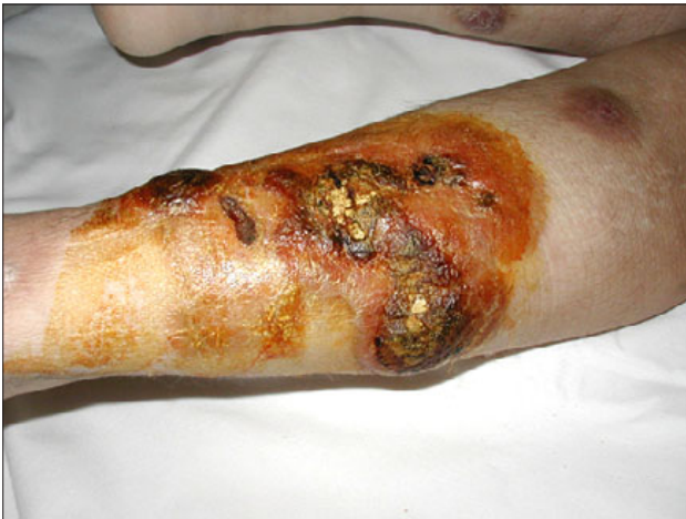
Fig. 2a. Isolated extramedullary relapse of ALL in the skin of lower limbs before treatment.